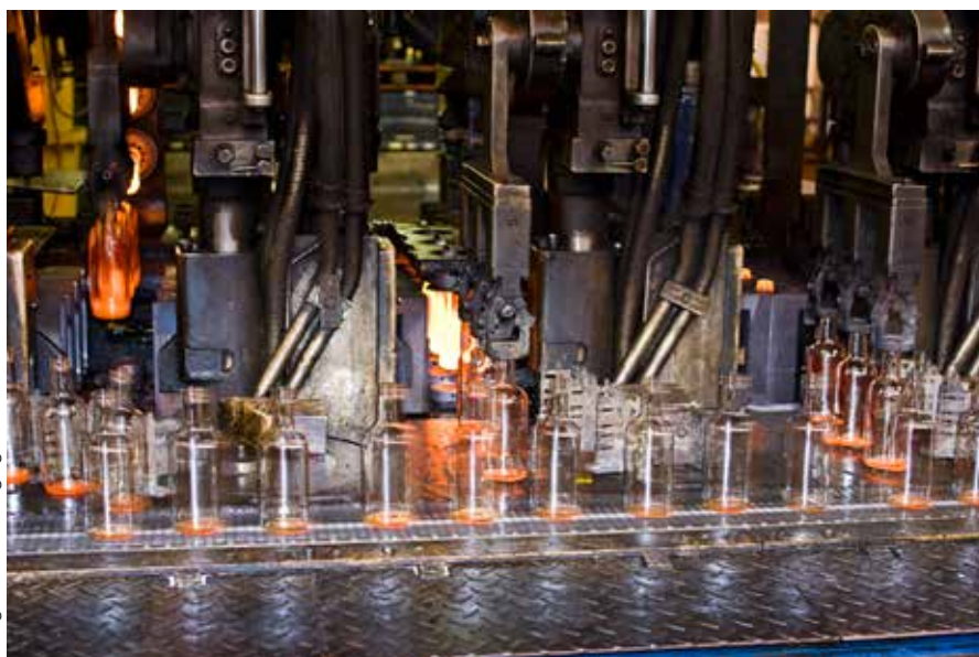
Glass bottles in a glass manufacturing plant.

The company's lightweighting journey began in the late 1990s when South Africa's markets opened to the rest of the world and industries were pressured to innovate quickly to catch up.