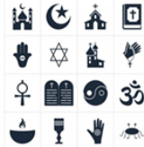
Religion/ Beliefs /Culture