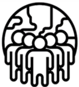
National/Ethnic/ Social Origin