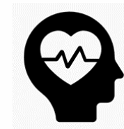
Physical/ Mental Health