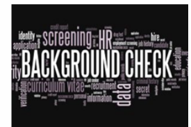
Educational/Medical /Financial/ Criminal or Employment History