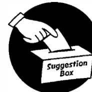
Personal Opinion, View, Preferences