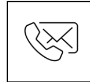
Email Address/ Contact Numbers