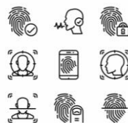
Photos/Video Footage Voice Recordings/Biometrics