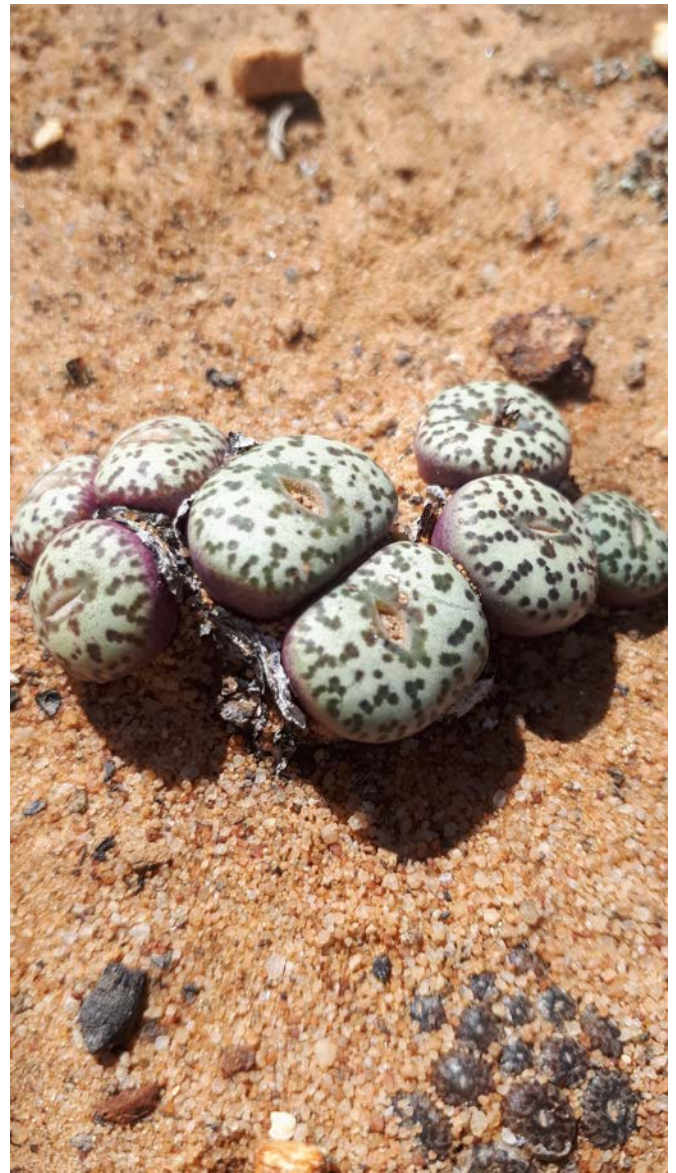
Figure 1. The highly poached and targeted Conophytum succulent plant species.