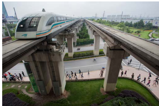
The Shanghai Maglev Train in China is the world's fastest train in operational service, with a maximum commercial speed of 431 km/h.

that this will not be possible. In normal operation the trains will travel at a maximum speed of 500 km/h, and this – together with the more direct, mostly underground route – would shorten the train journey from two hours to just 40 minutes.