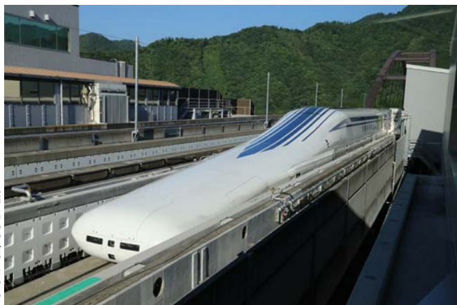
A Series LO train using SCMaglev technology reached a record-breaking speed of 603 km/h on the experimental Yamanashi Maglev Line in Japan in April 2015.

There are plans to extend the 43 km experimental line in both directions to form the Chuo Shinkansen maglev line between Tokyo and Osaka. An initial 286 km section between Tokyo and Nagoya was scheduled to open in 2027, but delays caused by the pandemic as well as environmental concerns about tunnel construction mean