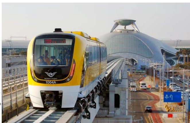
The Ecobee is operated on a 6 km route at Incheon Airport in South Korea.