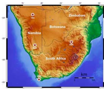
The geomagnetic observation network operated by SANSA consists of observatories at Hermanus and Hartebeesthoek in South Africa and at Tsumeb and Keetmanshoop in Namibia.

Convection in the molten core means that the geomagnetic field changes gradually in space and time. These changes, known as secular variation, have practical implications for navigation, geological magnetic surveys and various applications dependent upon precise orientation. Continuous monitoring is therefore conducted by geomagnetic observatories around the world, and the