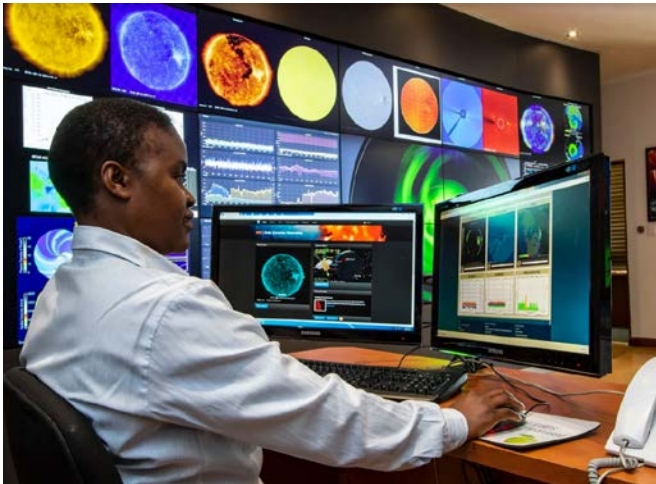
SANSA is in the process of upgrading its Hermanus facility to a 24-hour operational space weather centre.

southern Africa. Even before 1600, seafarers were making magnetic field observations at places close to the coast to check the accuracy of their magnetic compasses. The first systematic observations in South Africa resulted from the establishment in 1841 of a worldwide network of geomagnetic observation stations. One of these stations was built on the grounds of the Royal Observatory at the Cape of Good Hope, where observations were carried out intensely for some years and then – after the station burnt down in 1953 – only sporadically until 1870, when the Observatory’s director, Sir Thomas Maclear, retired.