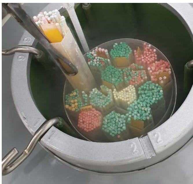
Sperm samples stored in liquid nitrogen tanks.

liquid nitrogen at a very chilly -196^{\circ}\text{C} (just below the boiling point of liquid nitrogen). We refer to this method of storage as cryopreservation. Along with a dose of biological antifreeze, this ensures that the cells remain in a somewhat live state. They become biologically inert, and can be preserved for years if kept at temperatures below -130^{\circ}\text{C} . The tanks are maintained by adding liquid nitrogen on a weekly basis to ensure that the samples remain submerged. This topping up is necessary to counteract the liquid nitrogen lost through 'boil off' as heat leaks into the tank, although even the vapour inside the tanks can remain below -130^{\circ}\text{C} .