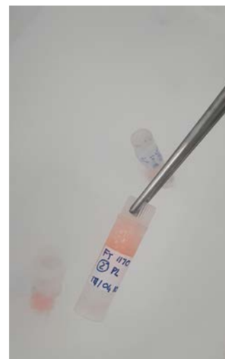
A lion biopsy is broken up into tiny chunks to be incubated in petri dishes filled with nutritious media. The resulting cell culture is then frozen in liquid nitrogen.