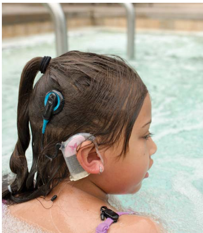
Cochlear Aqua Plus

People who are profoundly deaf or severely hard of hearing may benefit from a cochlear implant. This is an electronic hearing device consisting of an external part