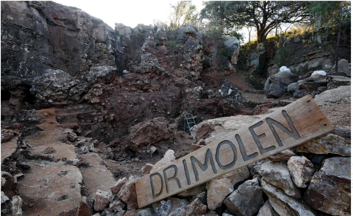
Andy Herries, CC BY-SA 4.0

Drimolen is a former dolomitic cave, the roof of which has eroded away. The ‘main quarry’ was excavated during lime-mining in the first half of the 20 th century.