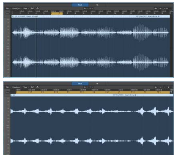
The soundtrack recorded during spinning of the largest pendant replica reveals the rhythmic, pulsing nature of the sound. The section highlighted in orange in the top wave output is shown in more detail beneath.

Interestingly, people entering an altered state of consciousness report hearing a buzzing sound as part of their hallucinatory experience. Bees are also depicted in