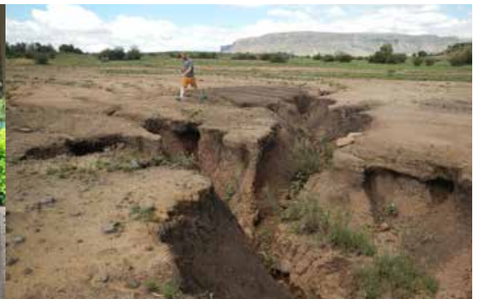
Some erosion gullies in the study sites have been surveyed using drones, and the resulting digital terrain models will allow changes to be monitored over time.

"At the end of the project we'll fly these areas again to see how things have changed," he says. "We're doing that mainly in the national parks because – given that they are directly protected by park management – it's basically just the rainfall or run-off signal that creates the dynamics of the gullies. In certain areas they are not a sign of land degradation, but we want to learn how they evolve naturally."