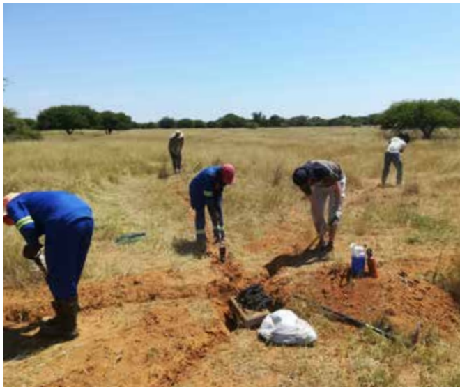
A moisture probe network consisting of eight sensors attached to a central unit has been installed at each site so that satellite-derived soil moisture data can be validated.

During the recent field campaign, a moisture probe network was also installed in each of the six study sites so that the soil moisture data derived from Sentinel-1 radar imagery can be validated. Each network consists of eight sensors placed in a 20 x 20 m area and attached to a central unit. Since these need to be protected from vandalism or theft, and the data downloaded every three months, they have been installed either in national parks or on the property of willing landowners. More specifically, one is at the Kruger National Park's sampling station near Lower Sabie, where there are a number of other monitoring instruments, another in Mokala National Park and a third in Augrabies National Park, while the others are on private farms near Pilanesberg, Ladybrand and Elim near Cape Agulhas.